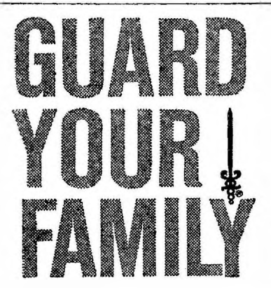
FIGHT CANCER WITH A CHECKUP AND A CHECK AMERICAN CANCER SOCIETY